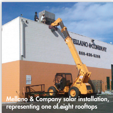
Mellano & Company solar installation, representing one of eight rooftops