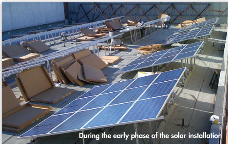
During the early phase of the solar installation